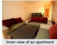
Inner view of an apartment